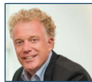
Allard Nooy President South-East Asia Fortescue Future Industries