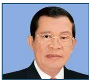
H.E. Samdech Akka Moha Sena Padei Techo Hun Sen Prime Minister Kingdom of Cambodia