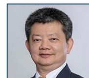
Prasertsak Cherngchawano Deputy Governor – Power Plant Development and Renewable Energy Electricity Generating Authority of Thailand (EGAT)