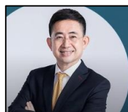
Boonyanit Wongrakmit Governor EGAT, Thailand