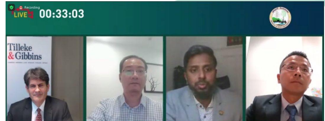
Taking Variable Renewable Energy (vRE) Technology to the Next Level: Scaling up Solar and Wind Capacity and Deployment in ASEAN