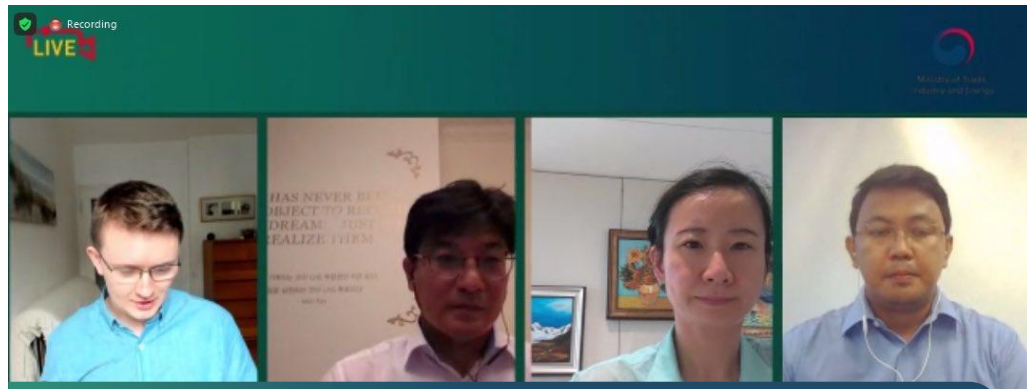
Energy Storage in Spotlight: Energy Storage as a Key to Grid Resilience and Democratizing Energy Access