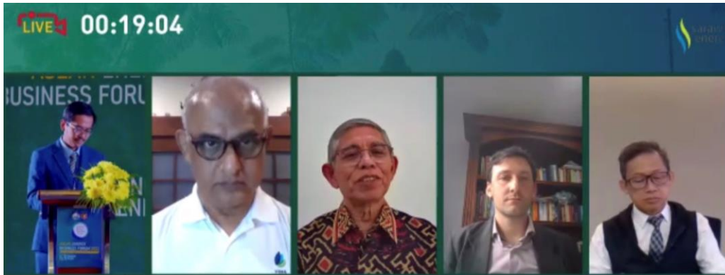
Renewable Leaders Panel: Unpacking ASEAN's RE Potentials to Accelerate Energy Transition