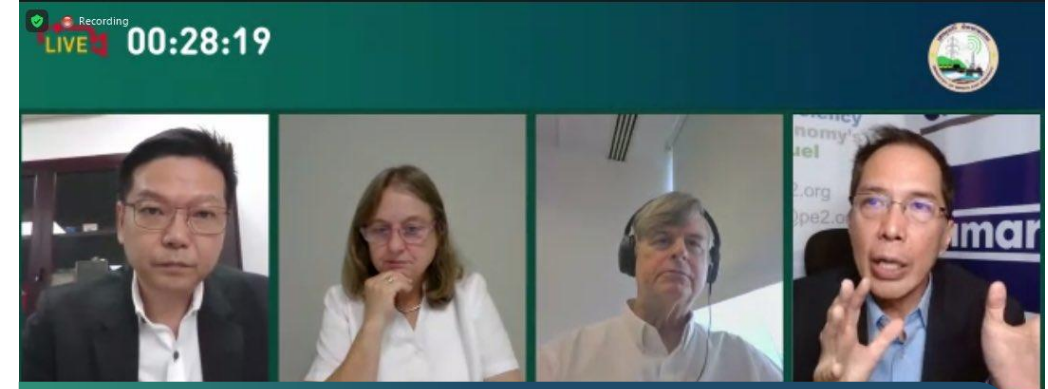
Energy Efficiency Panel: EE as the First Fuel – Low Hanging Fruits and Innovations in Refrigeration, Demand Side Management and Applications for Industry and ESCO